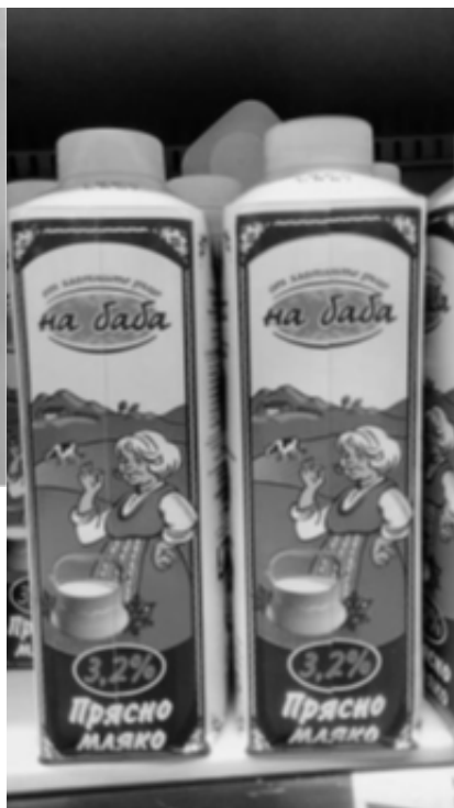
Fresh milk "Grandmother's" (This image contains some elements of the traditional culture – an old-fashioned food and liquid container and clothes typical for the Revival time)