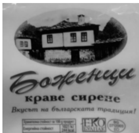
Cow cheese "Bozhentsi". The taste of Bulgarian tradition! (This picture presents the image of the traditional house with a common architecture from the Bulgarian Revival (19th century). It could be seen in other Balkan countries.)