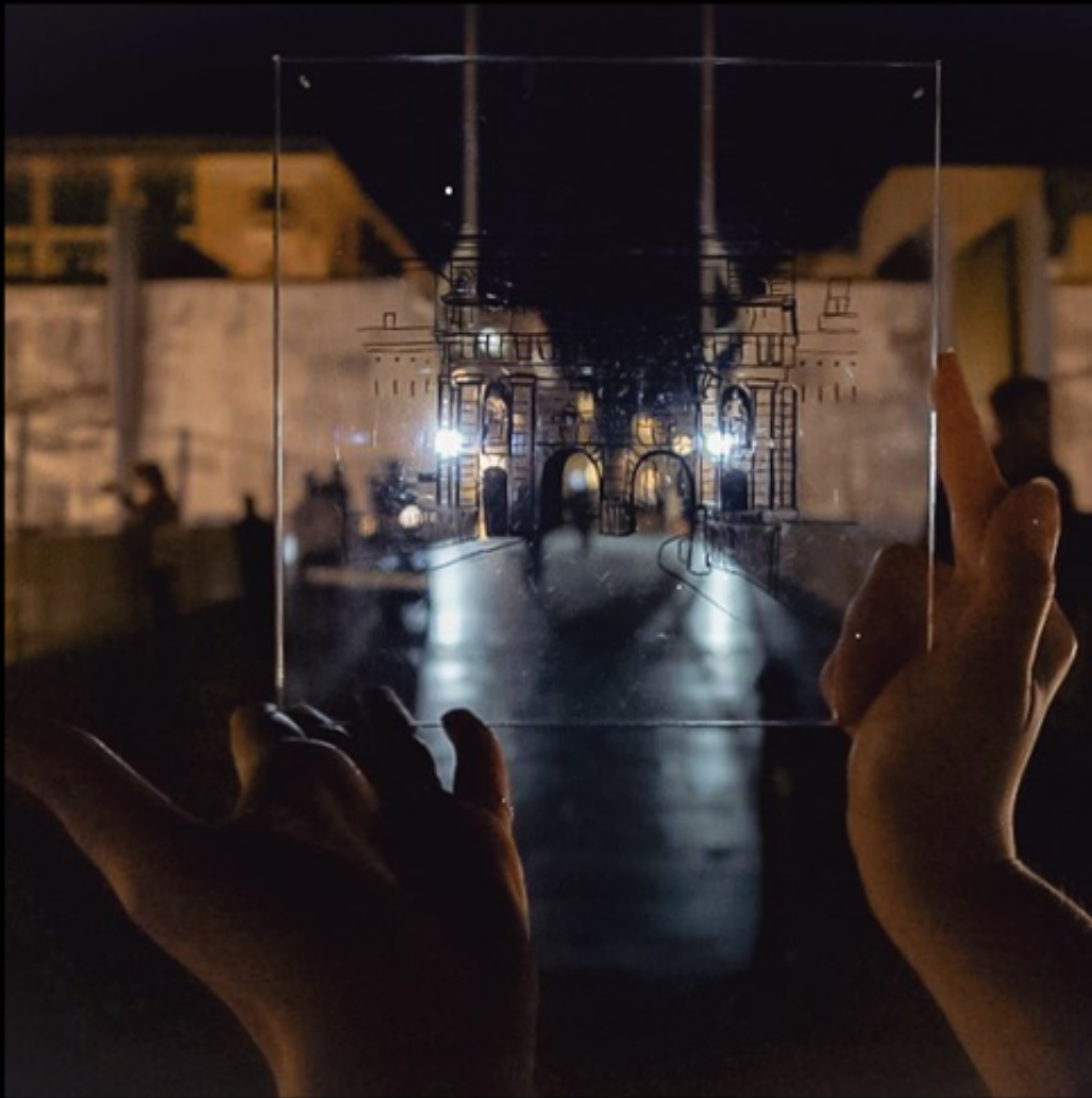
Enrique Tabone: Reverse Nostalgia

In the design market, one of the most popular new trends in the post-COVID time is the so-called 'Newstalgia' – as the blending word suggests it is a combination of the retro style techniques and the new technologies (Meister 2001). The Urban Dictionary describes it as “Something new that harks back to something old”.