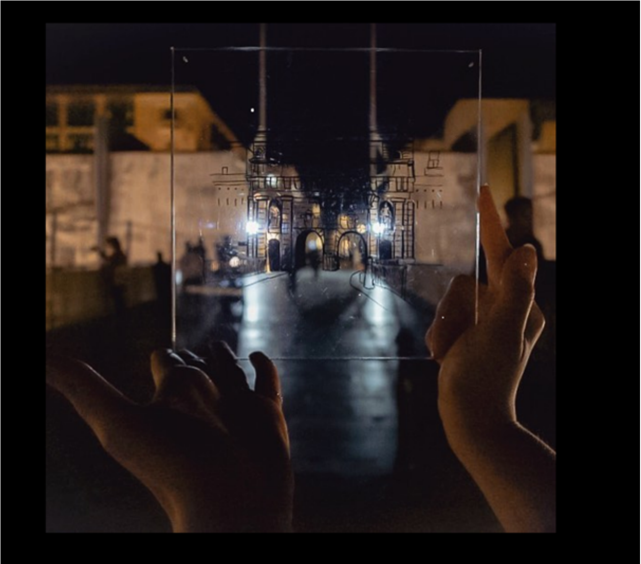
Enrique Tabone: Reverse Nostalgia

In the design market, one of the most popular new trends in the post-COVID time is the so-called 'Newstalgia' – as the blending word suggests it is a combination of the retro style techniques and the new technologies (Meister 2001). The Urban Dictionary describes it as “Something new that harks back to something old”.