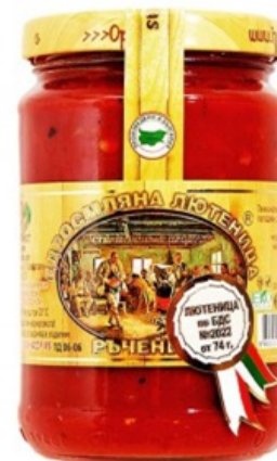
Lyutenitsa "Rachenitsa" (This is a jar with 'lyutenitsa' – a typical Bulgarian food, made from tomatoes and peppers. The label shows a famous piece of art – "Rachenitsa" by Ivan Markovichka (1894), which presents Bulgarian national customs and a traditional dance called 'rachenitsa'.)