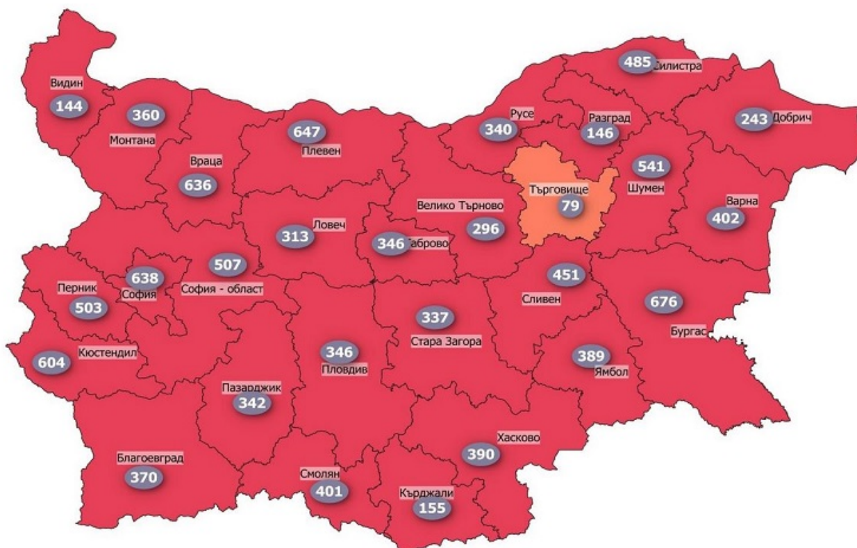
Visualisation of the second wave

There is more and more talk in Europe about the third wave of COVID-19, BNT news, Teodora Gateva, 06: 18, 16.11.2020 (updated), https://bntnews.bg